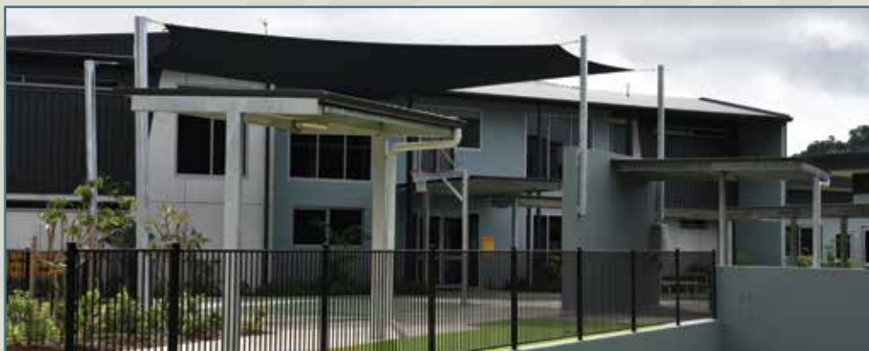
AFL Cape York Girls House

On a lighter and more positive note the Commissioners enjoyed a visit to and tour of the new AFL Cape York Girls House at Redlynch. Scenically located between sugar cane fields and mountains, the facility was opened in early 2019 and provides boarding for up to 40 young girls from Cape communities in a culturally appropriate, safe and secure residential environment. The Commissioners were very impressed and looked forward to sharing the message of the opportunities available at Cape York Girls House with the young women back in their communities.